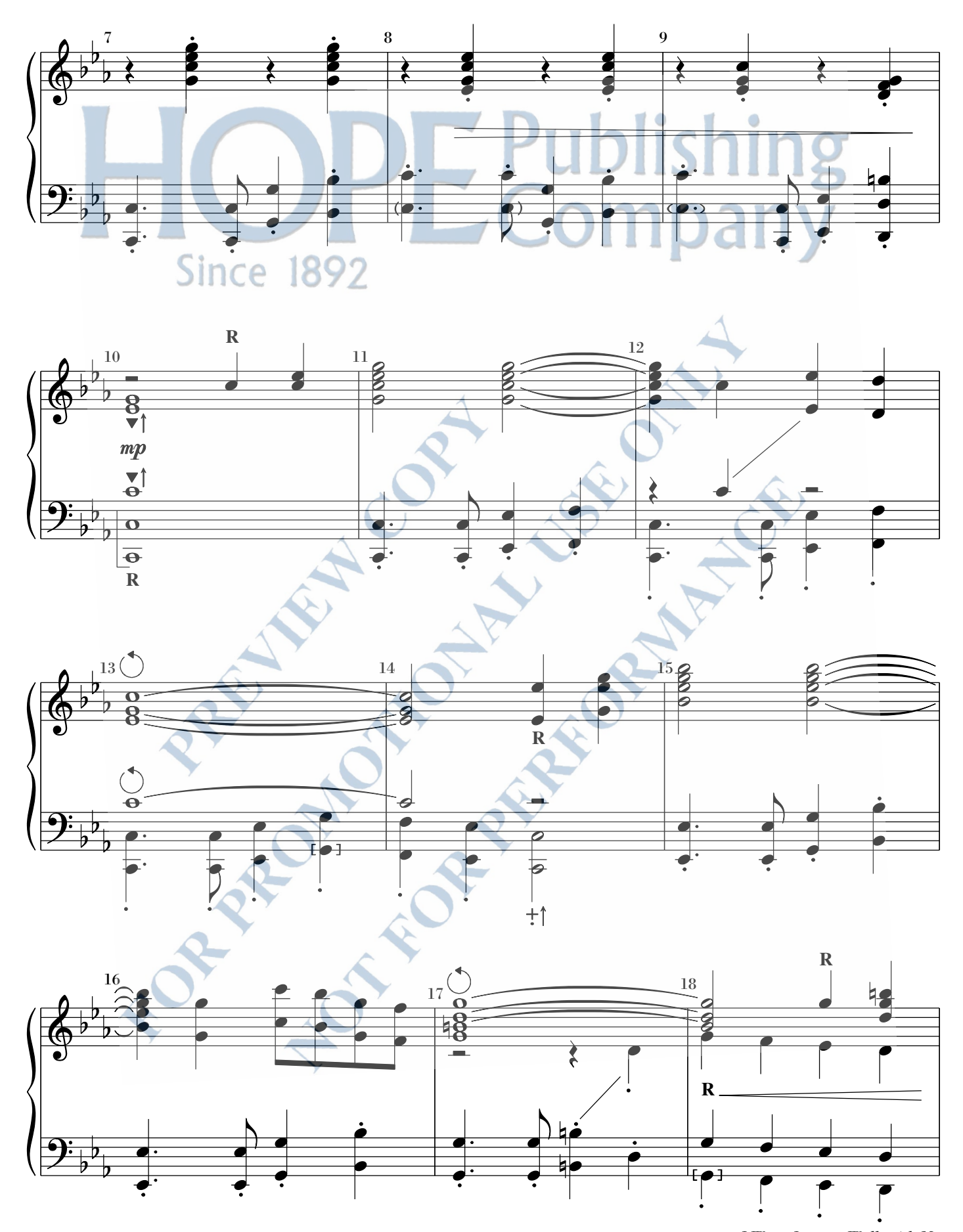
I\ Want\ Jesus\ to\ Walk\ with\ Me