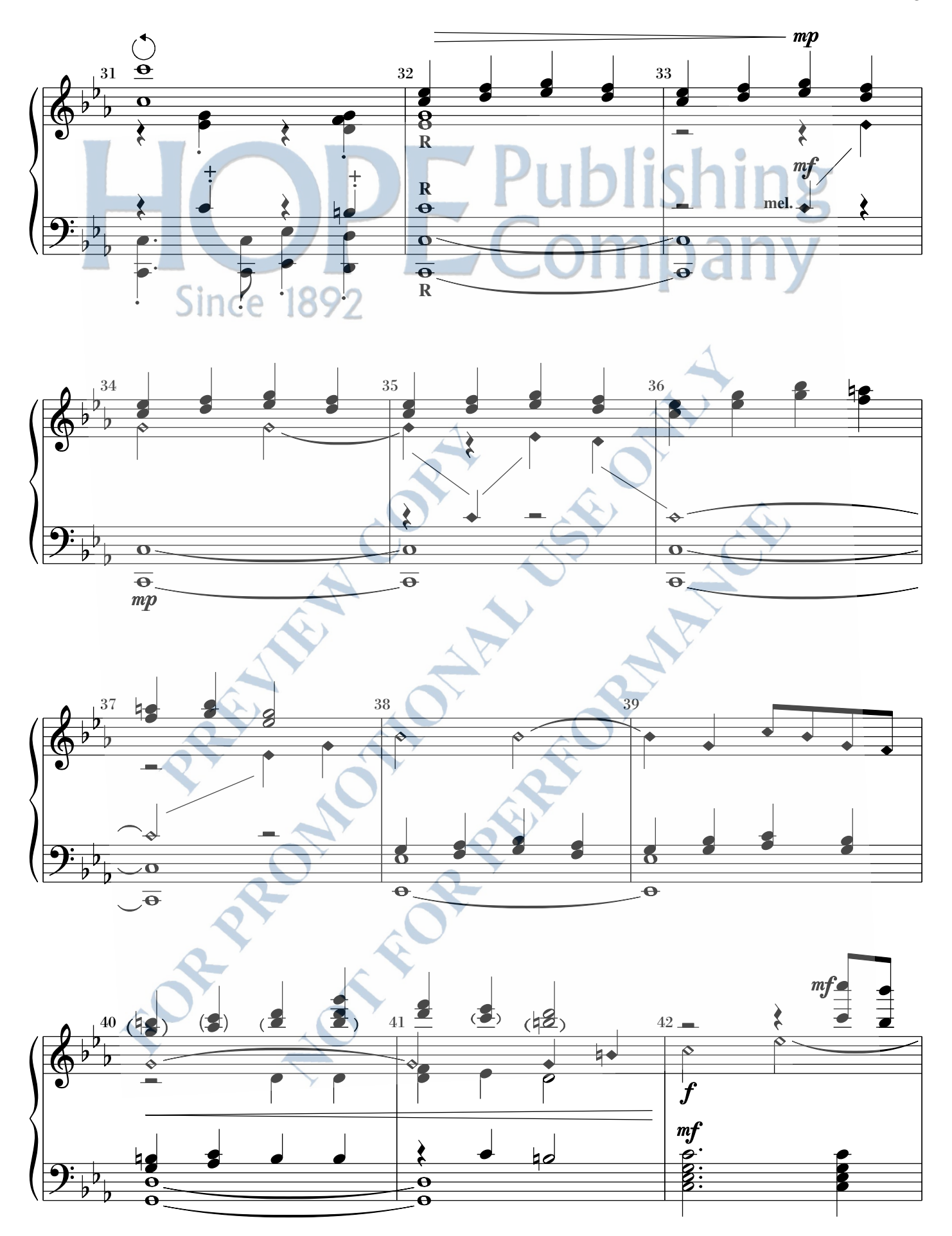
I Want Jesus to Walk with Me